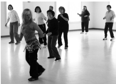
Zumba Gold class.

We are now going to have a program called Call & Ride . This program will provide rides for anyone over 60 years of age and older and to people of all ages who have a disability who have completed the application and are certified as a Call & Ride Rider (a card will be issued). Fares are $1.00 per ride to any of the participating NECCOG towns. The Call and Ride service will start in approximately 2 weeks. Anyone interested in filling out an application please contact my office at (860)546-9845, go to www.nectd.org on site go to Types of Service to download the application and send to my office or drop off, or call Northeastern Connecticut Transit District at (860)-774-3902.